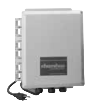
PW217-280 Control Panel Required (sold separately)

The Myers S50HT series high-flow pump is designed for dependability in demanding environments. All cast iron construction and special features to protect the motor make this a pump for the long haul. The S50HT in a boiler blow-down application can withstand liquid temperatures up to 200°F. The non-clogging, semi-open impeller ensures unimpeded flow for high-capacity sump operation.